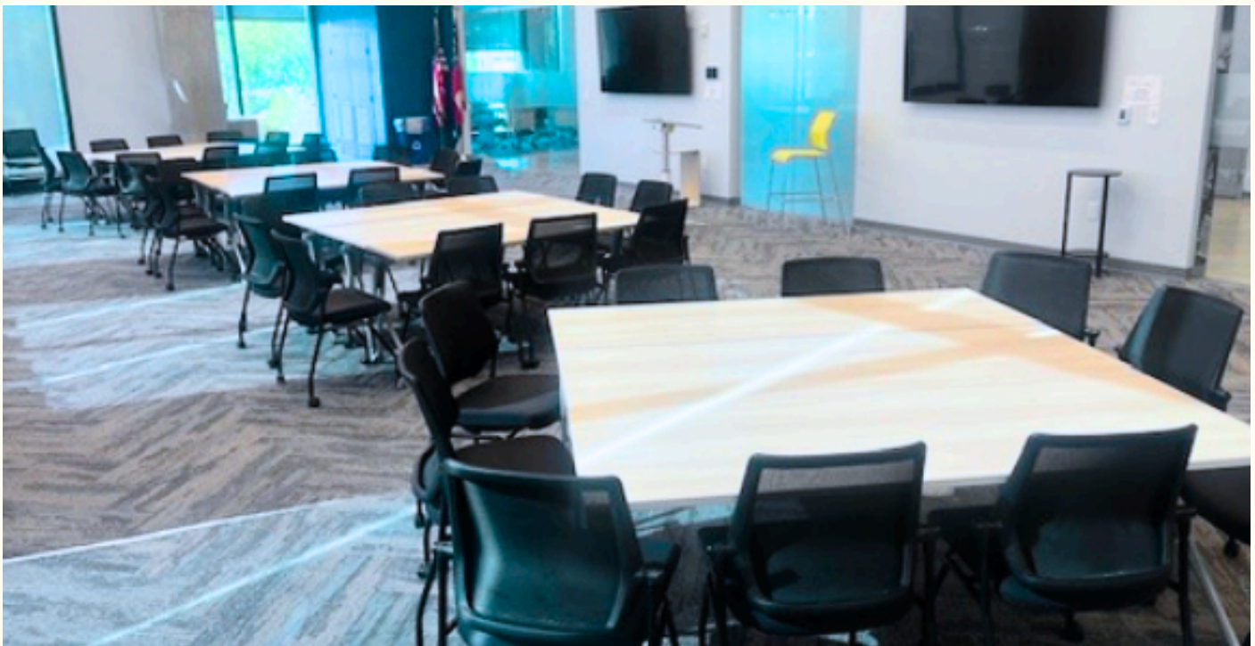
3 Table Pod Seats 8-10 per pod