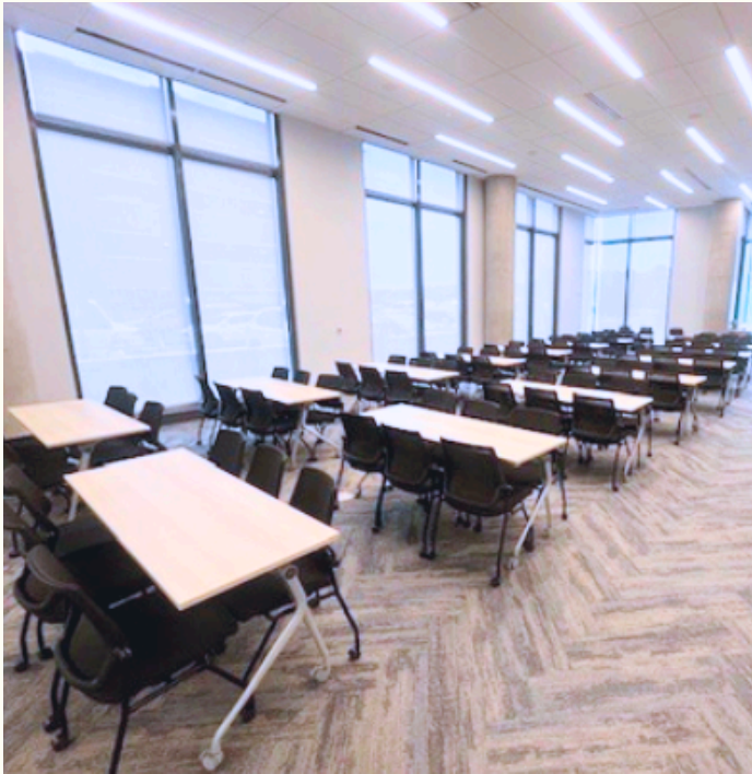
1 Table Pod Seats 2-6 per pod