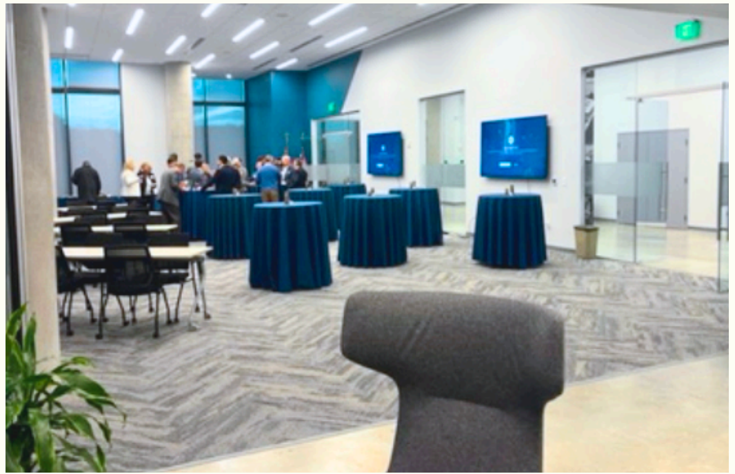
Rented High Top Table